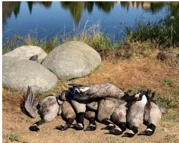
LOP 2020 - A total of 130 Canada Geese were killed. Most if not all were thrown in the garbage.

They're at it again. LOP is planning another slaughter of the geese anytime between today and January 29. Each licensed hunter can kill 30 geese per day. Rumor has it there are at least 10 hunters. Now do the math. If anyone thinks the WMST is going to stop at 80 dead geese, we don't.